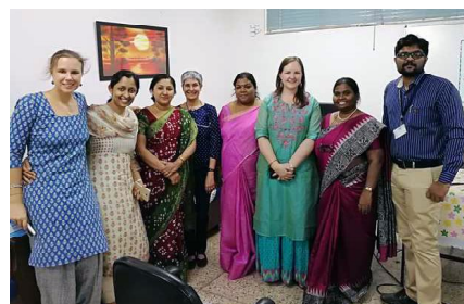
Resource persons of the Workshop along with TNAI officials