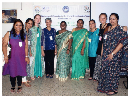
Resource persons of the Conference along with TNAI officials